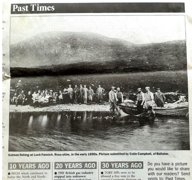
Salmon fishing at Loch Fannich, Ross-shire, in the early 1890s. Picture submitted by Colin Campbell, of Ballater.

https://atlanticsalmontrust.org/our-work/morayfirhtrackingproject/