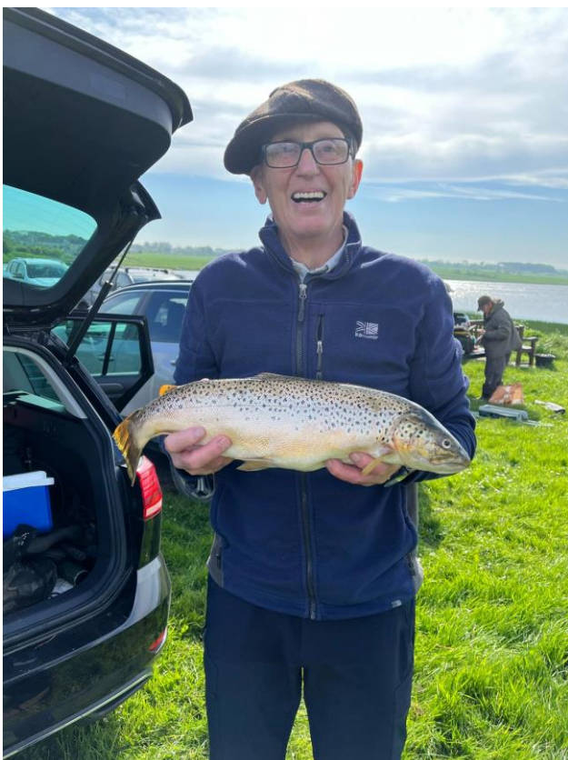
Happy boys' picnic lunch during the Meig Open